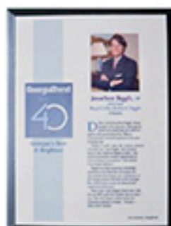
Legal Elite Plaque #2 9" x 12" black wooden plaque with silver writing on a white gloss surface with photo and description $325.00