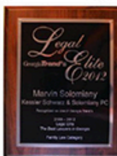
Legal Elite Plaque #5 8" x 10" wooden plaque with black plate with silver description $300.00

For more details and to place your order, contact Me'Sha Golden at 678.381.2163 or mesha@georgiatrend.com