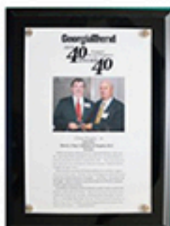
Legal Elite Plaque #4 9" x 12" sublimated plaque (directly on surface) black or cherry knob edges with photo and words $350.00