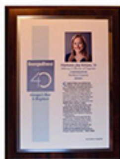
Legal Elite Plaque #3 9" x 12" cherry or black wooden plaque with silver and white plate background with photo and description $325.00