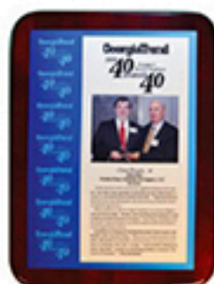
Legal Elite Plaque #1 9" x 12" rounded cherry wooden plaque with blue surface; photo and writing $300.00